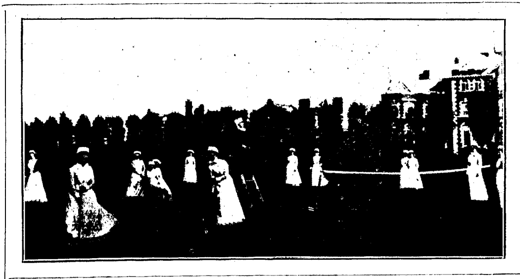
NURSES PLAYING TENNIS AND CROQUET.

many Metropolitan hospitals have not the conveniences which are possible in an institution further from the centre of London, where land is of fabulous value. Thus, annexed to each ward are its own spacious linen-room, store-